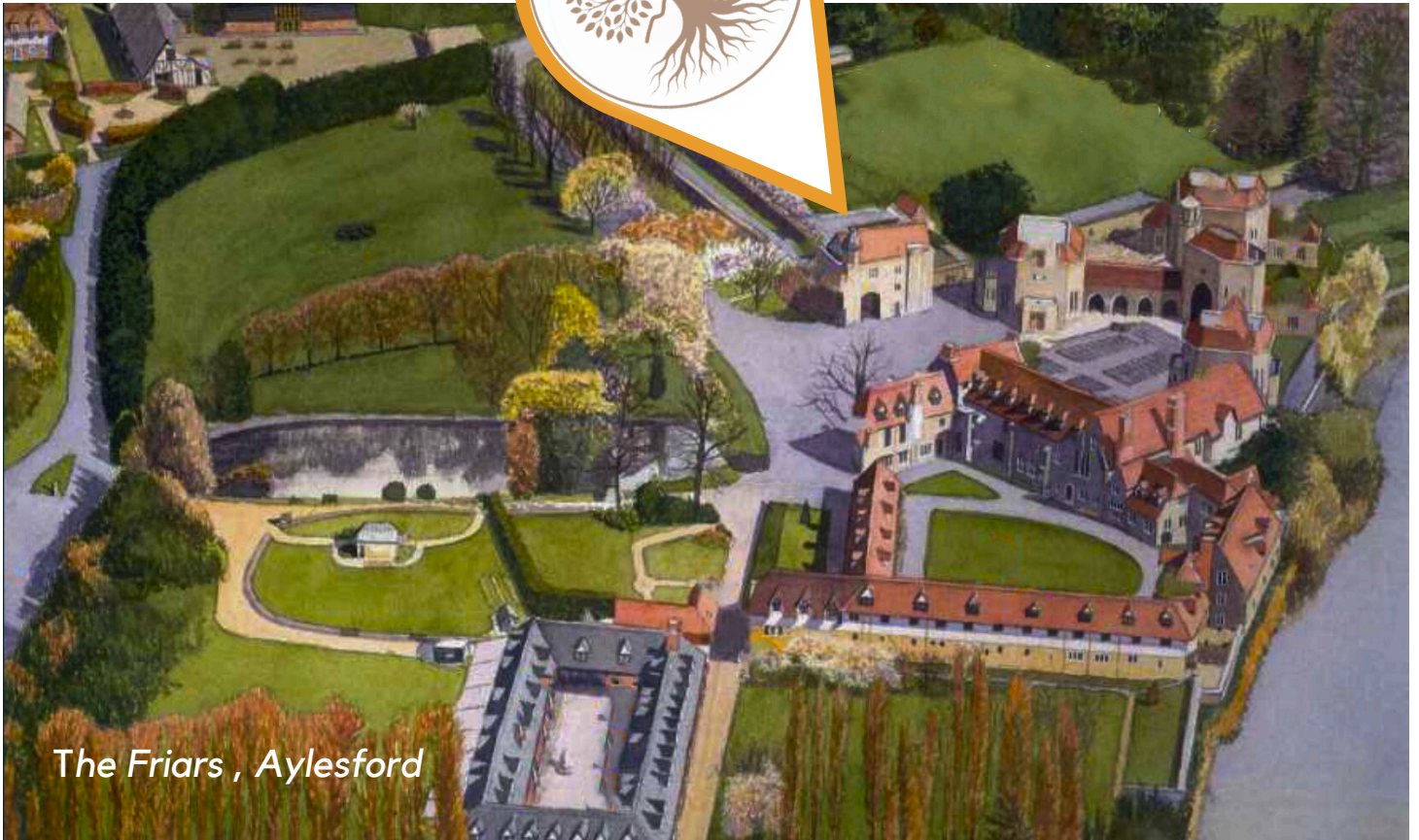
The Friars , Aylesford